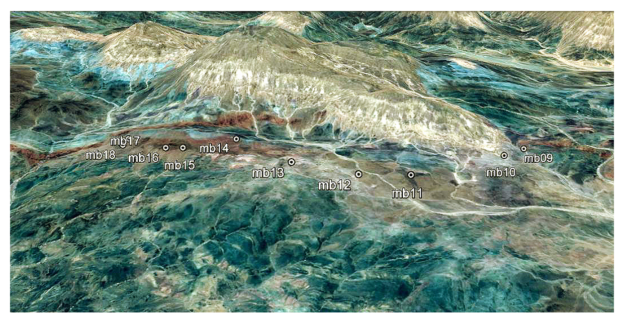
Figure 1. Showing the planned drill holes designed to infill gaps in the current drill pattern. Again, note the red gossans to the east and the yellowish silica-carbonate to the west. Base map is a digital elevation map (DEM).