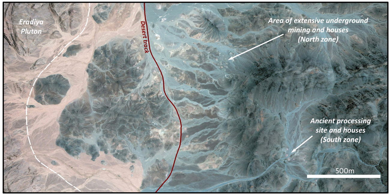
Figure 3: East Eradiya prospect (modified from Google Earth)

From the very limited exposure it is clear that the ancient miners were targeting quartz reefs hosted by a shallowly eastward dipping shear zone. The sheared rock is highly weathered and appears to have been intensely hydrothermally altered. Two sets of quartz veins are visible, one sub-vertical, and the other set of veins dipping parallel to the fabric of the shear zone. The vein quartz is heavily copper-stained with supergene chrysocolla and malachite, and limonite after sulphides. From the limited exposures and the surface topography the shear zone would appear to sub-crop over an area a little under 500m long and 180m wide, striking NNE. Other ancient workings have been identified to the west of the East Eradiya, close to the granite contact. The host rock appears to be a tuffaceous andesitic unit, mostly comprising lapilli tuffs.