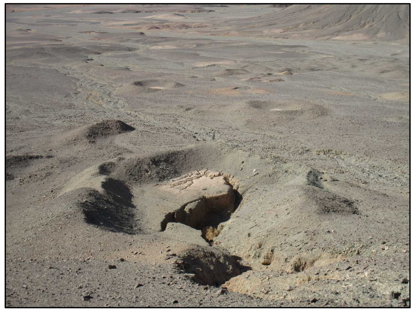
Figure 4: Ancient workings at the East Eradiya north zone prospect (the water erosion feature in the nearest pit appears to be an old shaft)

Following the identification of extensive ancient workings in the area a programme of deep ground penetrating radar geophysical profiling has been carried out at the East Eradiya north zone. Surface trenching is also planned to expose the mineralised structures to allow mapping and sampling at East Eradiya.