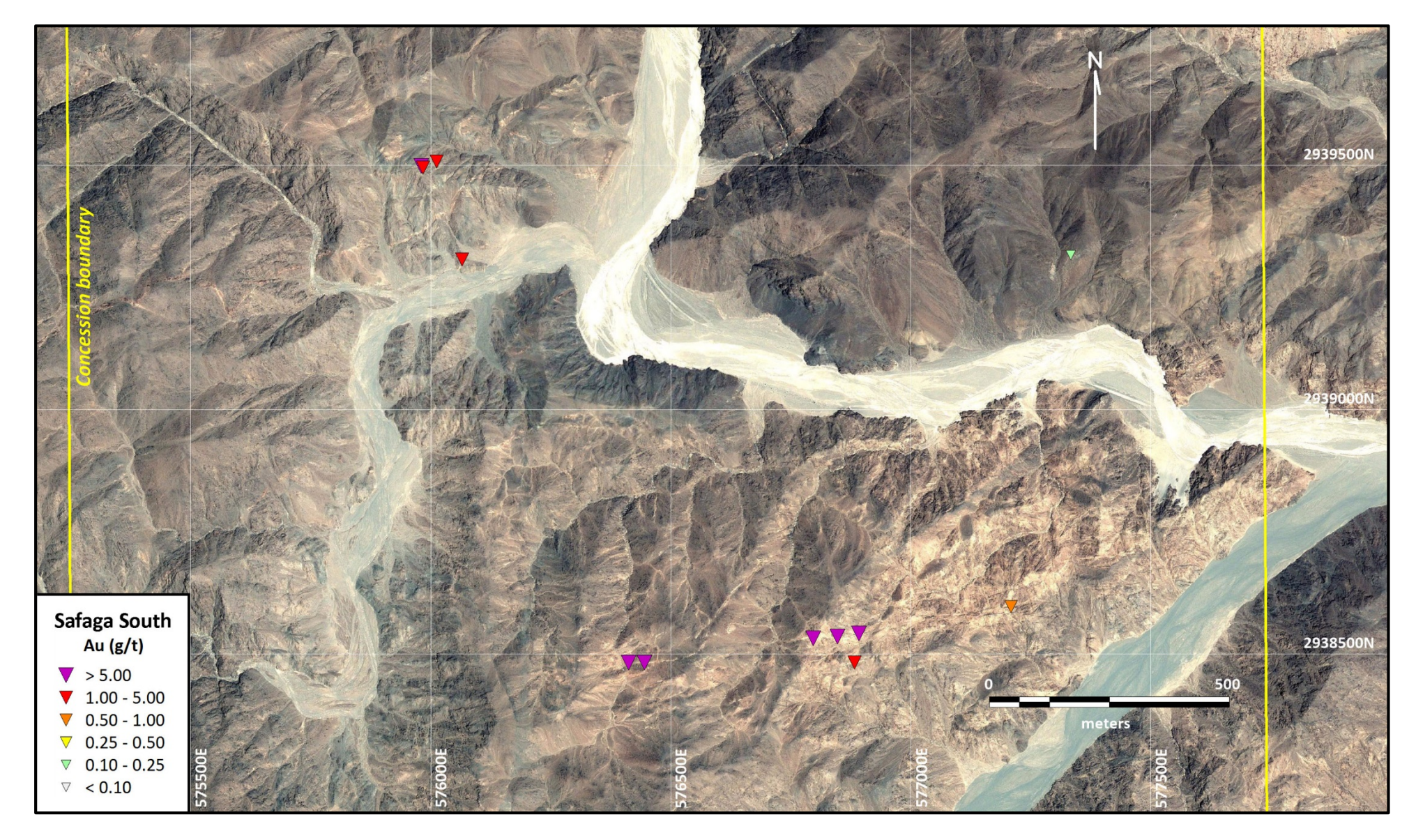
Figure 3: Safaga South prospect, showing the location of surface samples